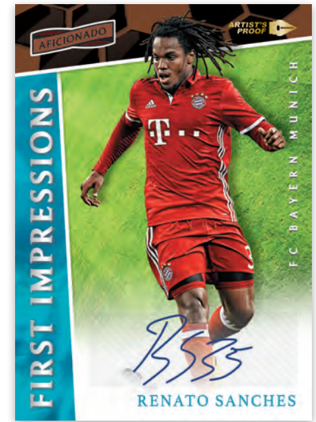
FIRST IMPRESSIONS ARTIST'S PROOF GOLD

Aficionado boasts a diverse autograph checklist. Find autograph cards of past soccer stars such as Pele and Diego Maradona, current greats such as Cristiano Ronaldo and Kevin De Bruyne, and budding stars such as Renato Sanches and Dele Alli! All autograph cards are numbered from 149 to 1!