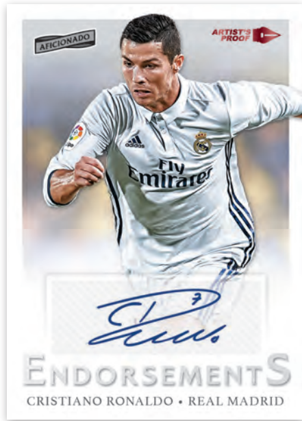
ENDORSEMENTS ARTIST'S PROOF RED