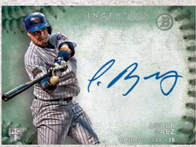
Rookie Autographed Card - Green Parallel

Bowman Inception Baseball-In Stores June 2015