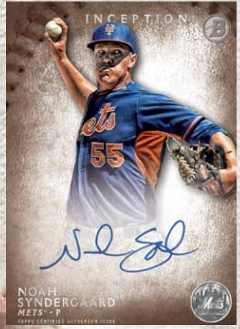
Prospect Autographed Card

Additionally, chase the newly added Future Stars Autograph Relic cards featuring unique game-used jersey patch relic pieces from the 2014 SiriusXM All-Star Futures Game ™.