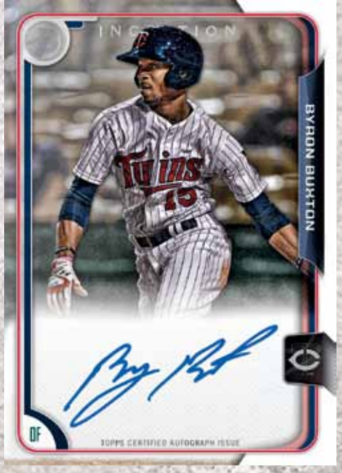
Bowman Inception Autographed Card