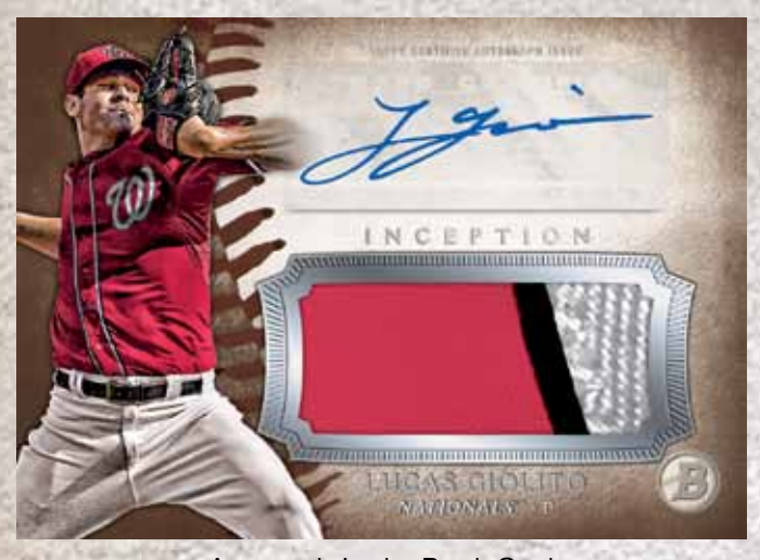
Autograph Jumbo Patch Card