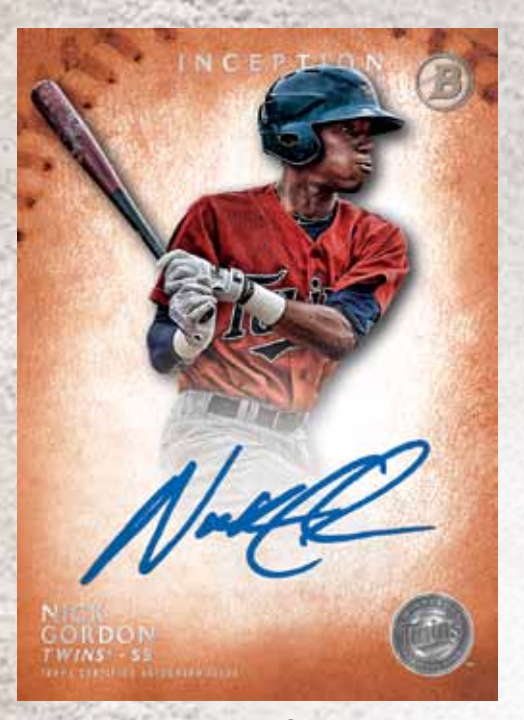
Prospect Autographed Card - Red Parallel