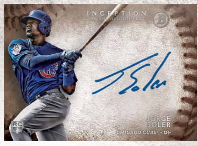
Rookie Autographed Card