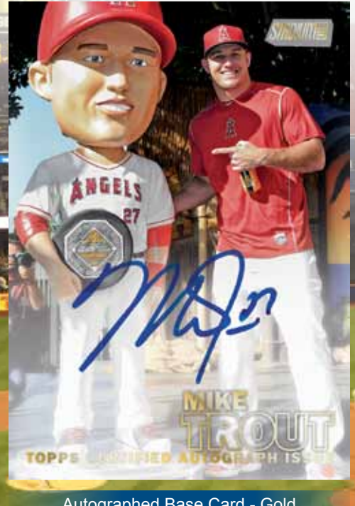
Autographed Base Card - Gold