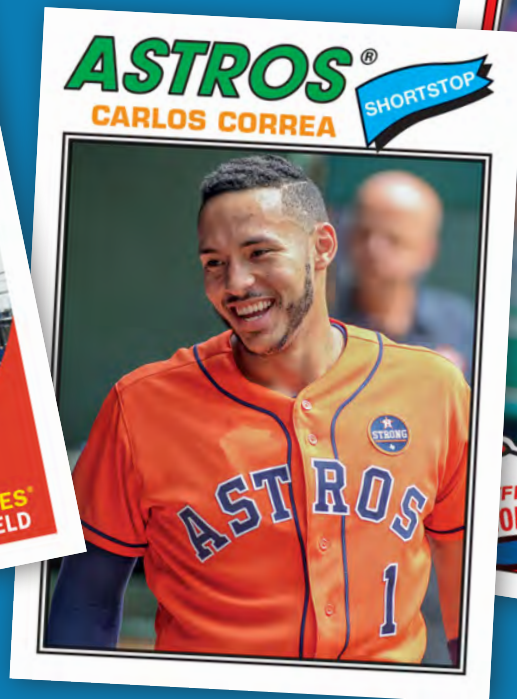
1977 Topps Base Card