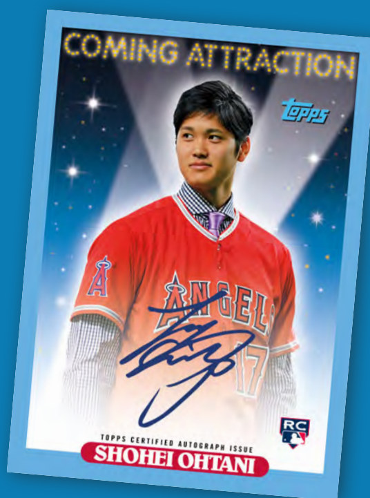
Coming Attraction Autograph - Blue Parallel