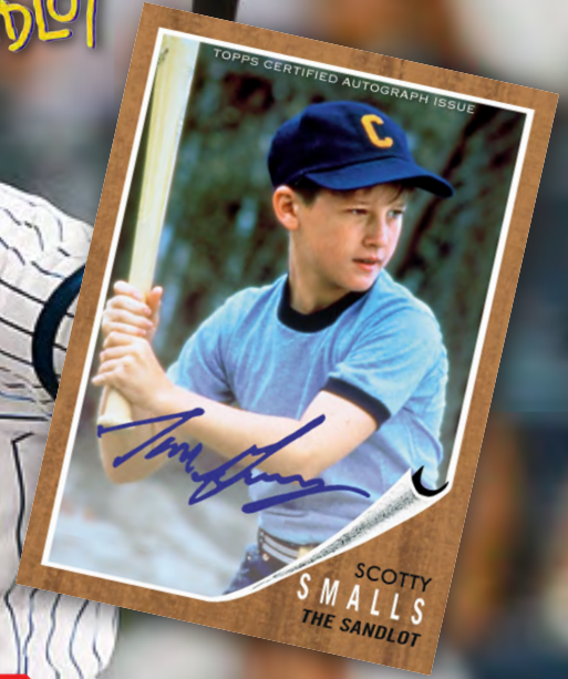
The Sandlot Autograph Card