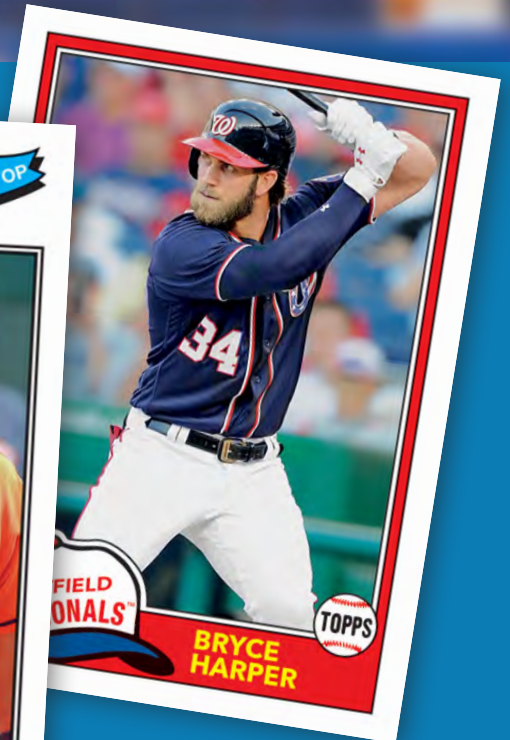
1981 Topps Base Card

2018 Archives will celebrate Topps' renowned 1959, 1977, and 1981 designs across a 300-card base set. Look for a limited number of unannounced card variations, themed accordingly.