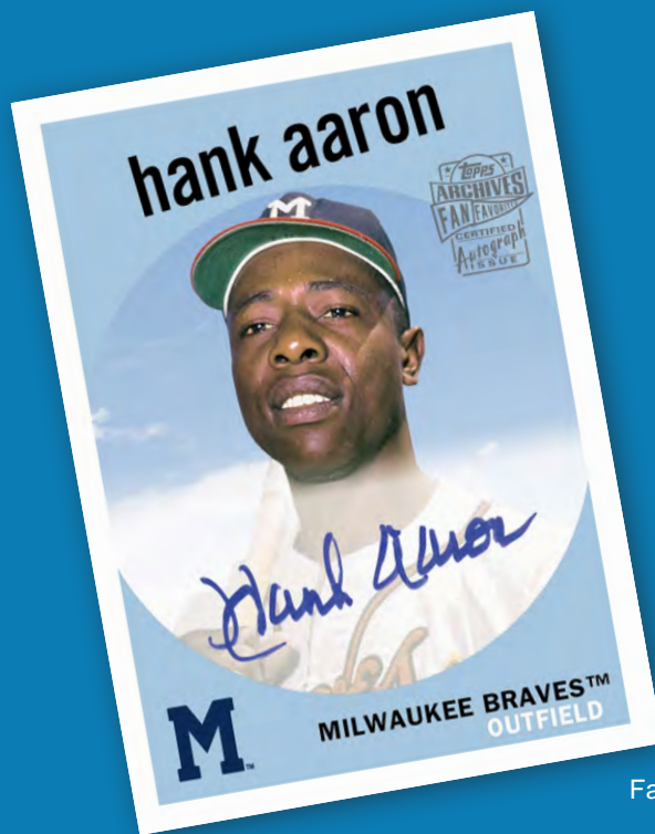
Fan Favorites Autograph

This year's autograph checklist will feature an array of baseball personalities and short-printed subjects along with the Fan Favorites and active MLB ® greats to which Archives™ is accustomed.