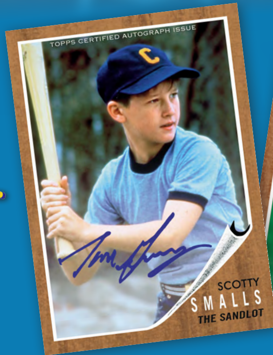
The Sandlot Autograph Card