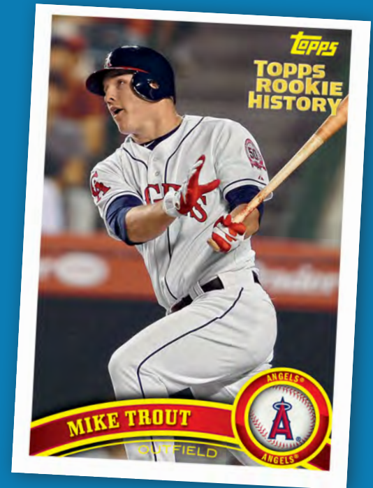
Topps Rookie History Insert - Gold Foil Stamp

A recreate of the Coming Attraction design from 1993 Topps showcasing 2018's biggest rookie names.