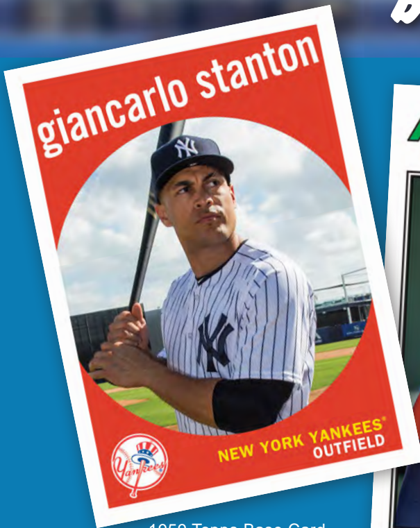
1959 Topps Base Card