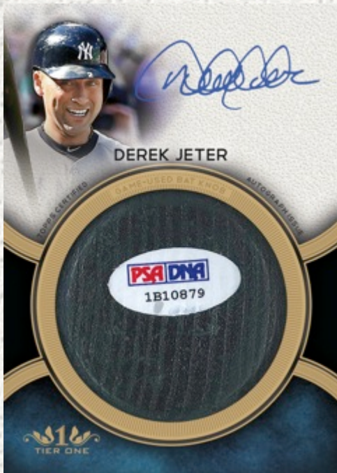
Tier One Autographed Bat Knob Card