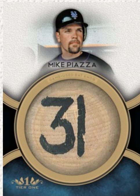
Tier One Bat Knob Card