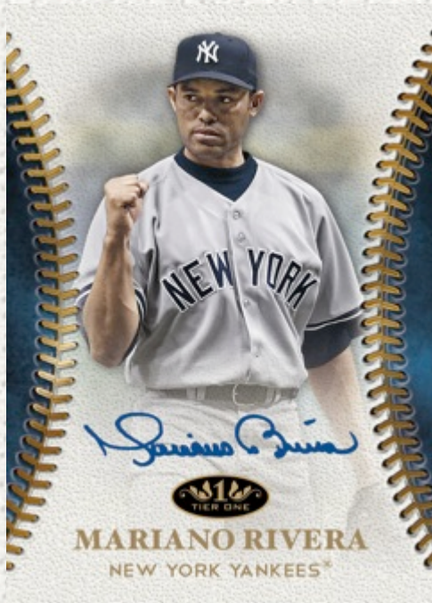
Tier One Autograph Card