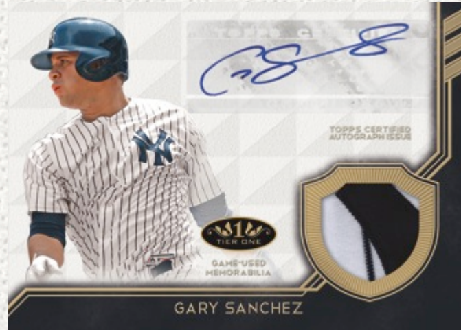
Autographed Tier One Relic Card