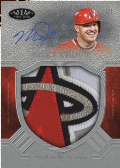
Autographed Prodigious Patches – Platinum Parallel