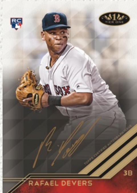
Break Out Autograph Card – Bronze Ink Parallel