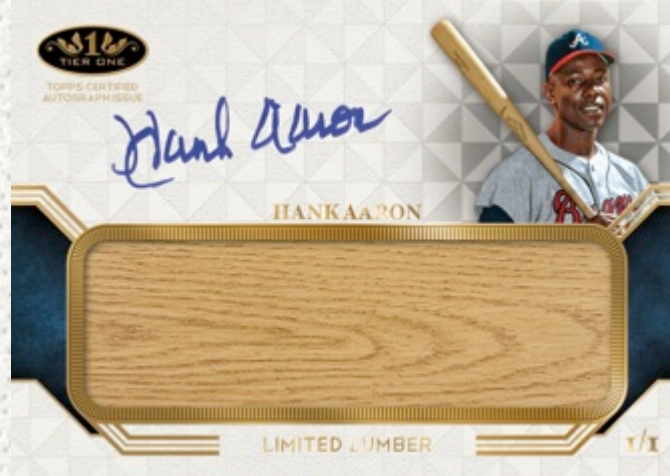
Autographed Limited Lumber Card