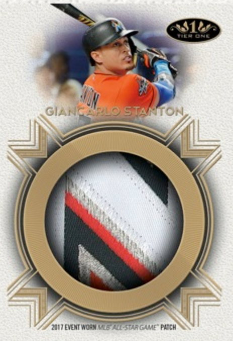
Tier One All-Star Patch Card