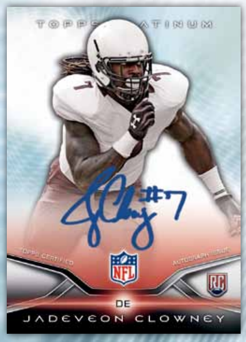
Autographed Rookie Refractor Card -SuperFractor Parallel

**All rookie images and base cards will be NFL-branded with updated photography and NFL team logos. All relics will be authentic NFL jersey memorabilia.