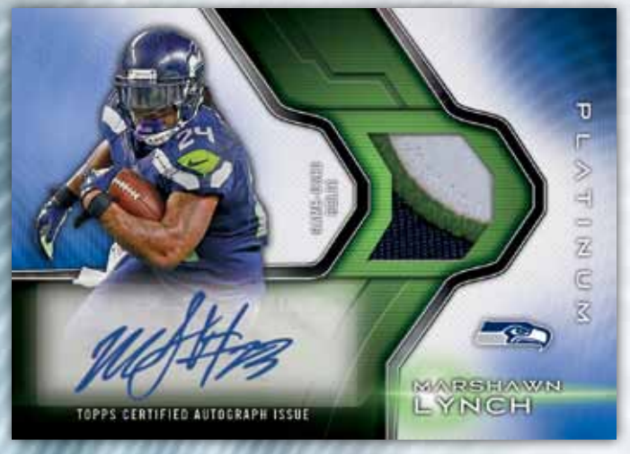
Autographed Veteran Refractor Patch Card