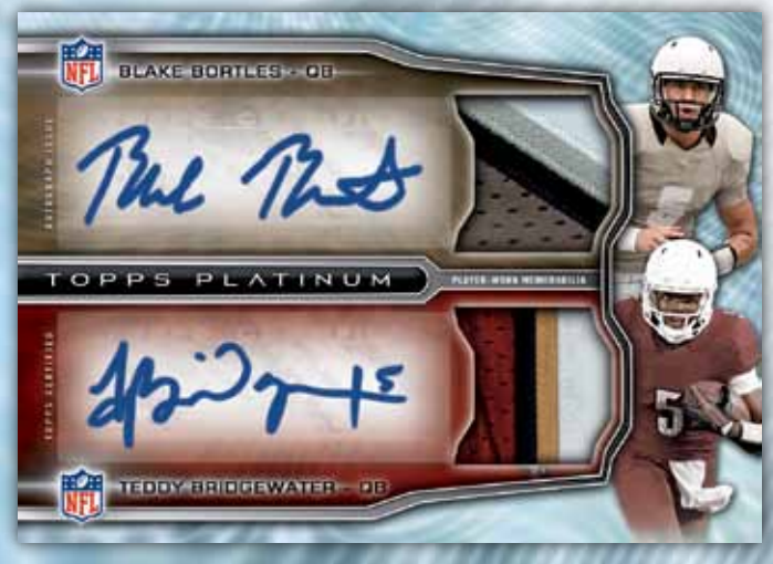
Dual Autograph Dual Patch Card

Dual Autographed Dual Patch: dual autographs and standard-sized patches featuring the most collectible rookie pairings on chrome refractor technology with surface applied stickers. Sequentially #'d to 25. HOBBY ONLY!