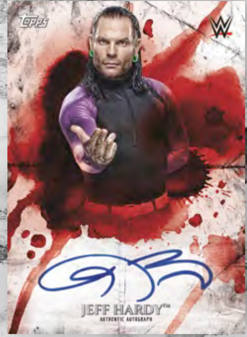
Autograph Card – Red Parallel

Undisputed Autographs: Autographs from Men's and Women's Division WWE Superstars, WWE Legends and NXT prospects!