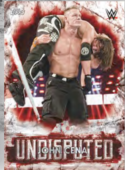
Base Card – Red Parallel

Each pack contains 1 Autograph or Relic Card! 8 Autographs & 2 Relic Cards per box!