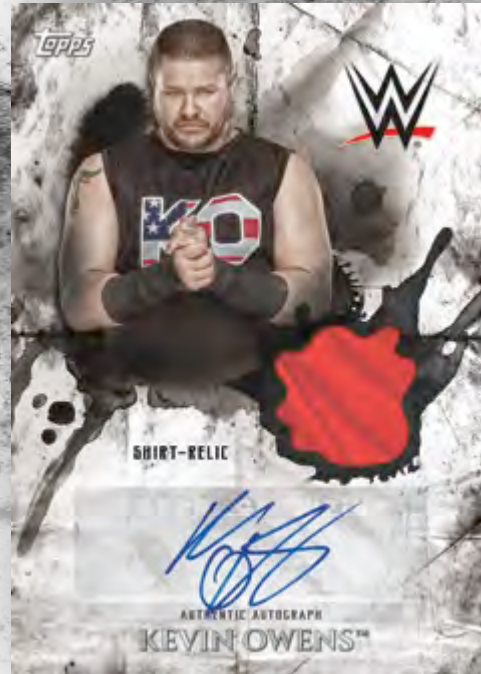
Autograph Relic Card

Undisputed Relic Cards: Featuring a Superstar-worn shirt relic!