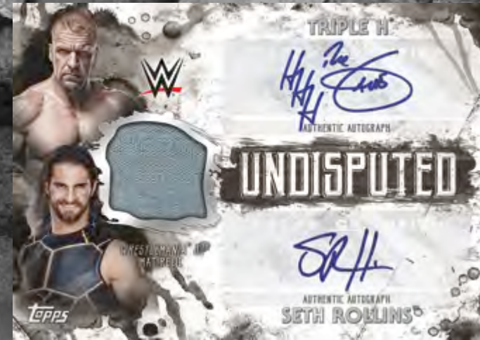
Classic Matches Dual Autograph Relic Card

Featuring the top Men's and Women's Division WWE Superstars, WWE Legends and NXT prospects in spectacular designs on premium, thick card stock!