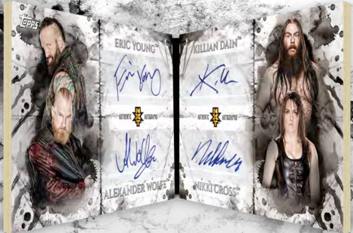
Quad Autograph Book Card

Autographed Kiss & Shirt Relic Book Cards: With an autographed kiss and a jumbo shirt relic swatch from a WWE or NXT Women's Division Superstar! #d to 5.