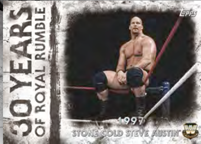
30 Years of Royal Rumble Card

30 Years of Royal Rumble : Showcasing Royal Rumble Match winners!