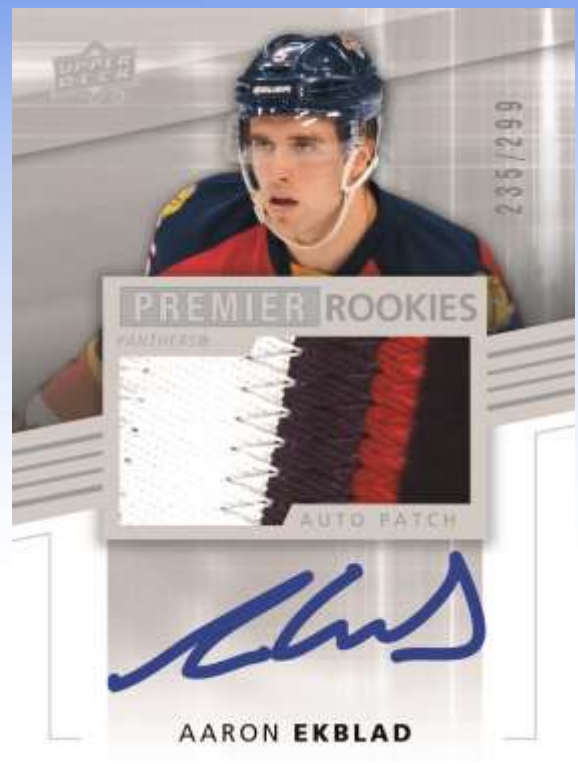
Acetate Rookie Auto Patch