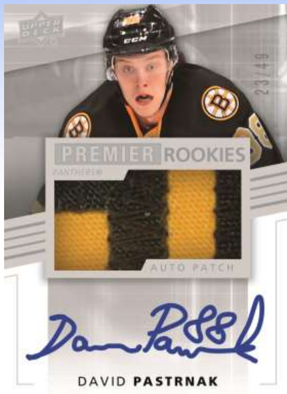
Acetate Rookie Auto Patch, Silver Spectrum Parallel