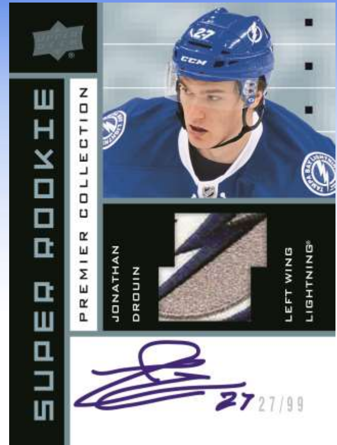
'02-03 Premier Collection Super Rookie Auto Patch Tribute