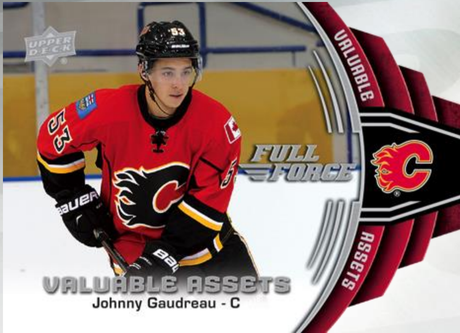
Valuable Assets – Die-Cuts!