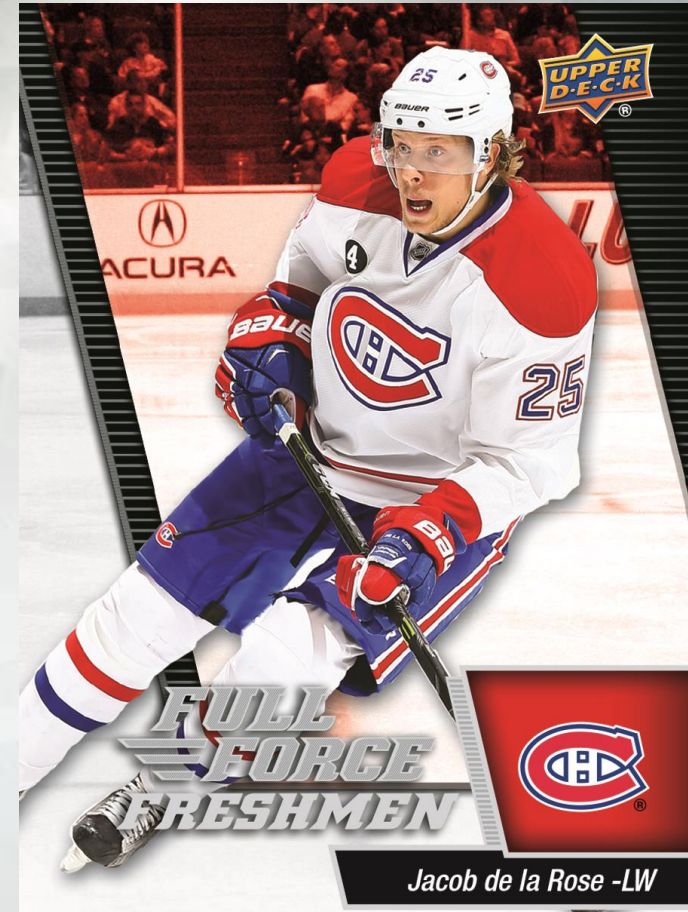
Full Force Freshmen