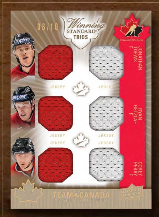
WINNING STANDARD TRIOS Toews/Getzlaf/Perry - (#'d to 10)