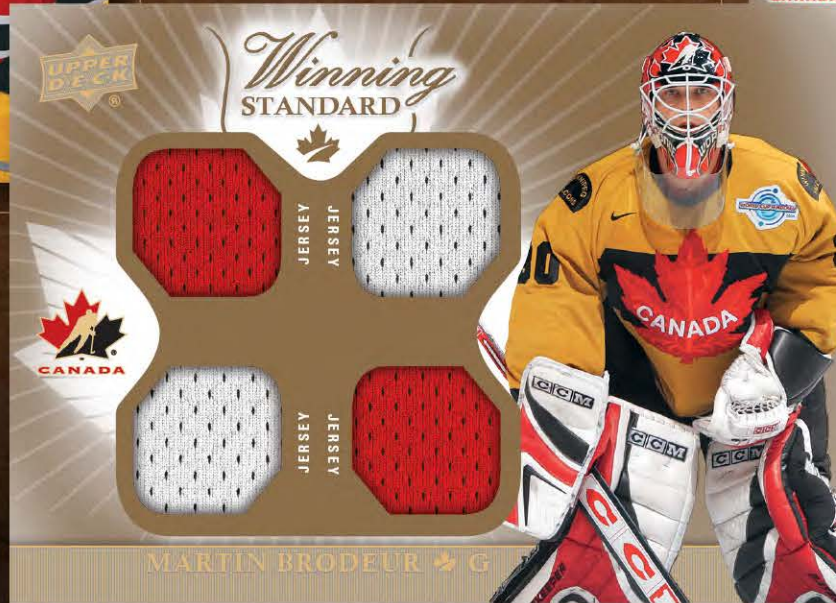
WINNING STANDARD Martin Brodeur