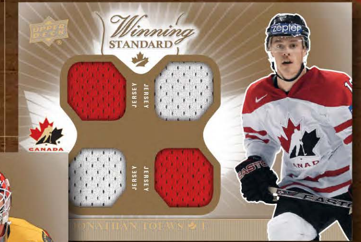
WINNING STANDARD Jonathan Toews