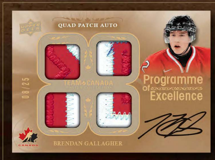
PROGRAM OF EXCELLENCE QUAD AUTO PATCHES Brendan Gallagher - (#'d to 25)