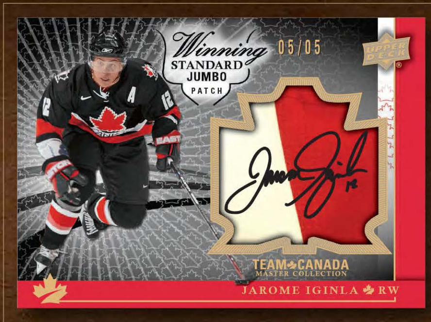
WINNING STANDARD SIGNED JUMBO PATCHES Jarome Iginla - (#'d to 5)