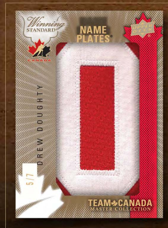
WINNING STANDARD NAMEPLATES LETTER Drew Doughty - (#'d to 7)