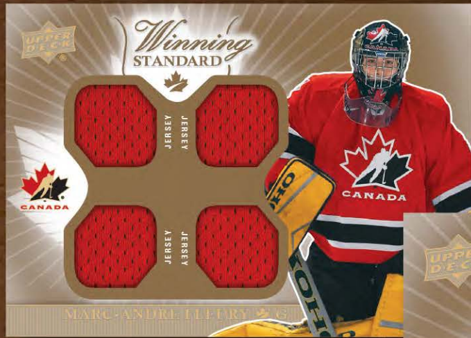
WINNING STANDARD Marc-Andre Fleury