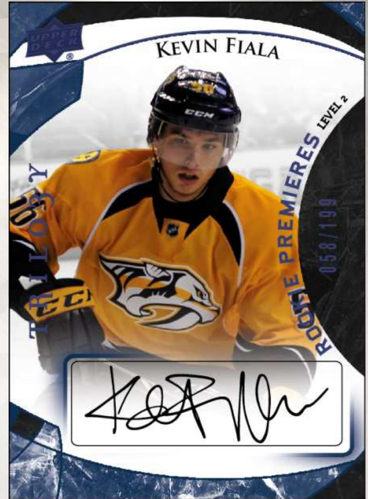
Uncommon Auto Rookie, Blue Parallel