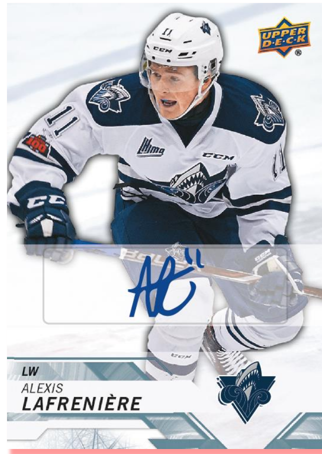
BASE SET AUTOGRAPH