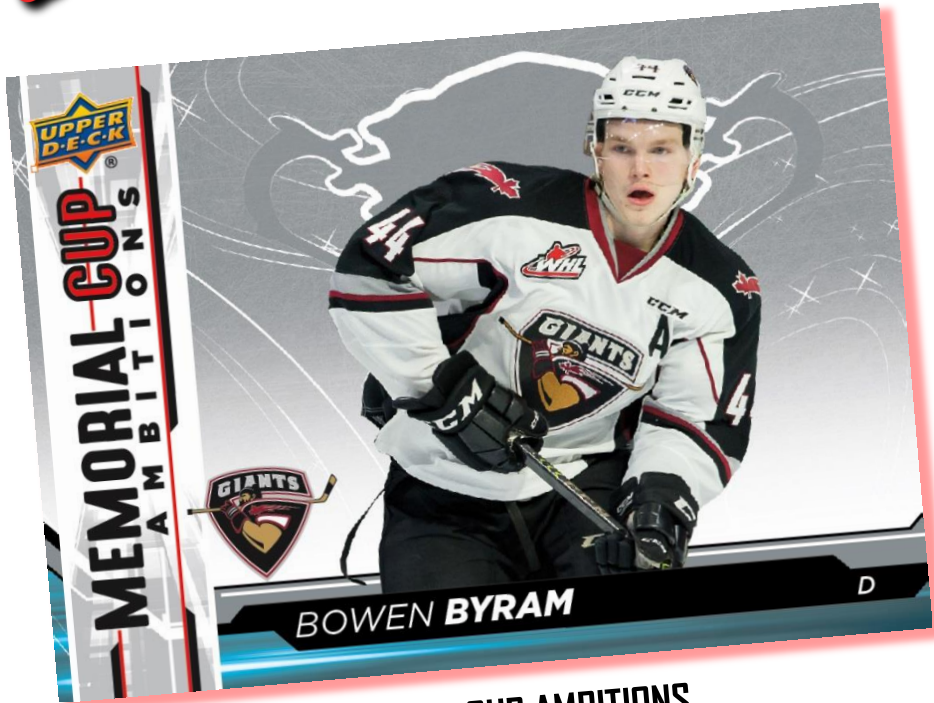
MEMORIAL CUP AMBITIONS